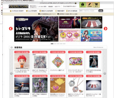
Bandai official online store PREMIUM BANDAI

We are developing contents that can be widely enjoyed on the Internet such as the official websites and online store for characters and toys, and TV program support apps.