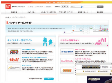
Bandai official brand websites list

We operate a large number of brand websites that not only provide product information but also communicate the charm of the works and the characters together with explaining how to play extensively. Moreover, we are globally expanding our official online store PREMIUM BANDAI, including in Hong Kong, Taiwan and Singapore.