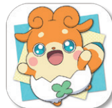
The TV program support app KAMISAMA MINARAI: HIMITSU NO COCOTAMA