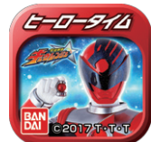
Hero Time, the program support app UCHU SENTAI KYURANGER