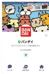
Official BANDAI LINE account

We are developing Bandai's official channels on the LINE smartphone app, which deliver new products and campaign information, and YouTube, which deliver videos that adults and children can enjoy. In addition, we also develop game apps linked to TV programs and GUNDAM information websites for overseas users.